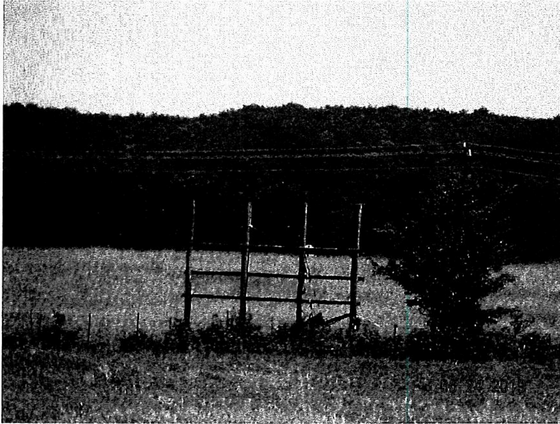
Reg. No. 8538 Sign File No. 1194-02 US-69, Muskogee County