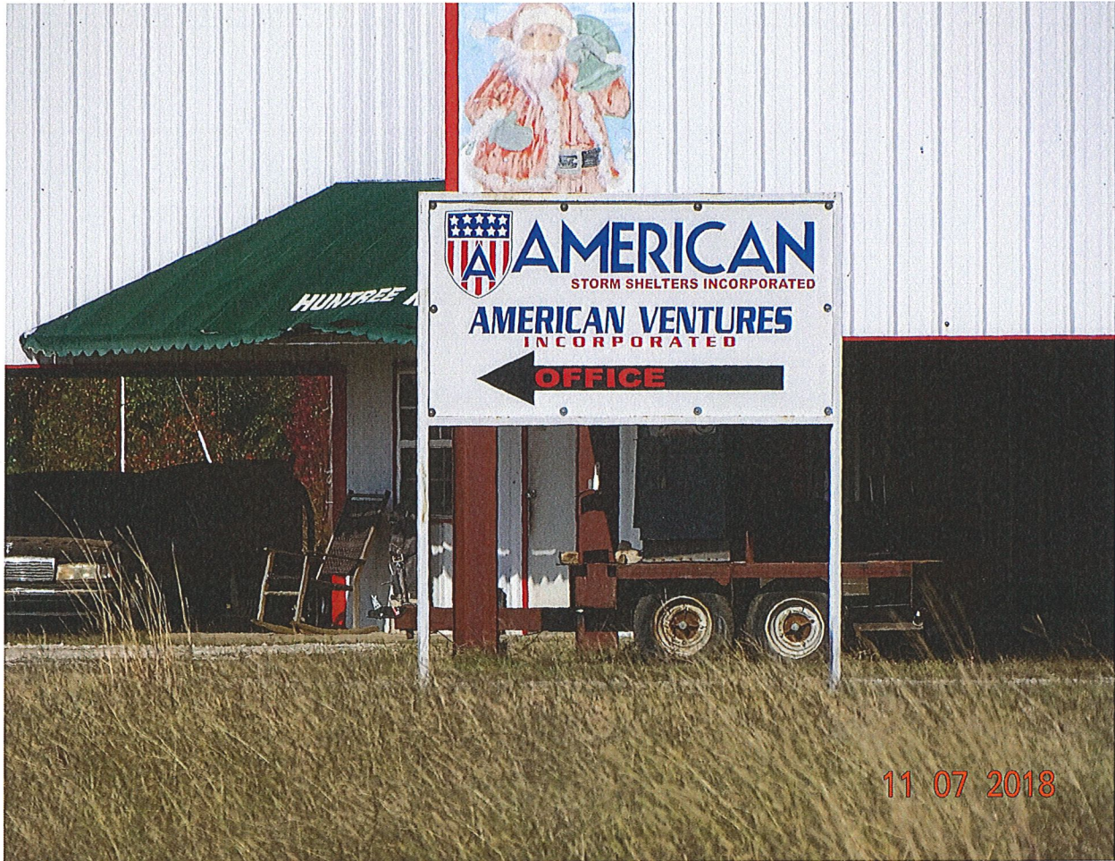
Sign File Number 1541-03 US-59, Sequoyah County