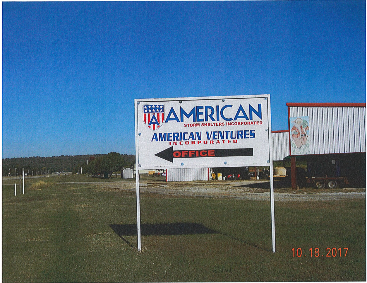
Sign File Number 1541-03 US-59, Sequoyah County