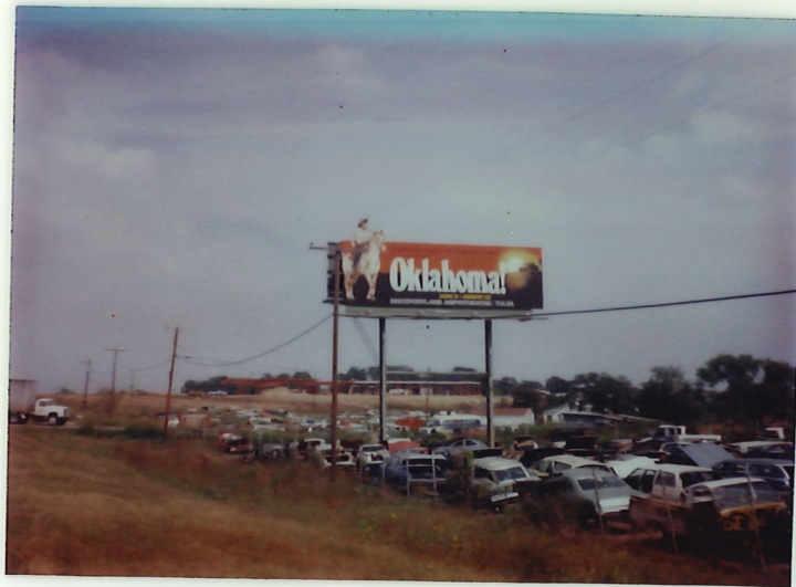
6249 New Sapulpa Rd.