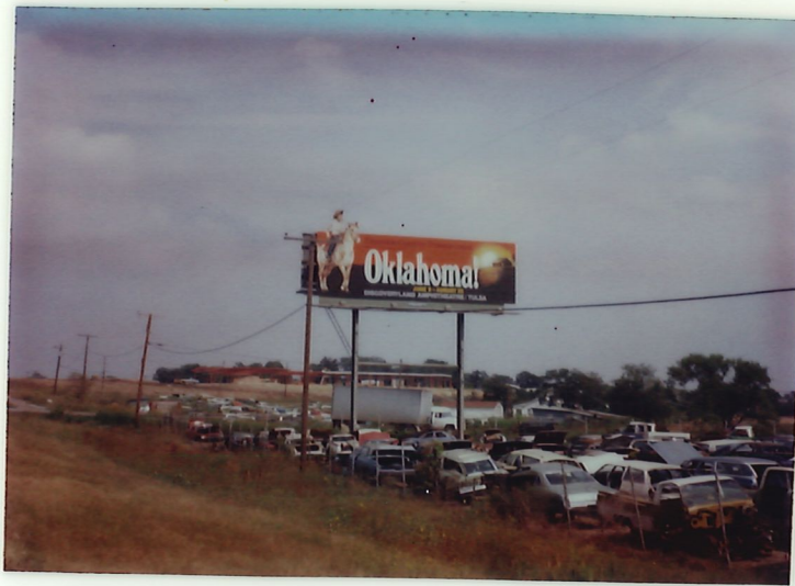
6249 New Sapulpa Rd.